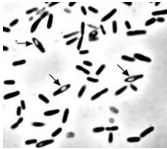
Figure 2. Endospore in Alicyclobacillus ( Alicyclobacillus sendaiensis [000.000.659] | BACTERIA | Pinterest | Sendai and Microbiology).