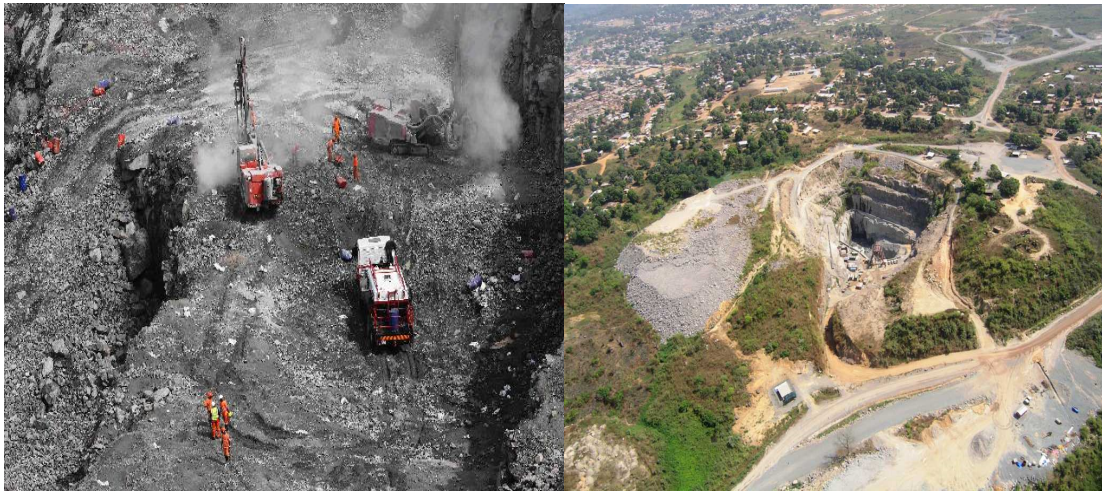
Figures 2. Kimberlite mining and open-pits by Koidu Holdings Company [51, 52].

fields into useless piles of red earth and have virtually diverted or block streams that use to flow into the nearby residential areas. Heavy machinery mining have resulted in excessive run-off, loss of productive lands, massive gullies, heavy erosion, water contamination, sink holes, reduction into soil infiltration, and nutrient leaching. This type of mining has the tendency of rendering previous viable lands barred for agricultural purposes as well as creating a non-habitable birds and animal environment. Jackson et al. [50] have concluded that mineral resource exploitation most times results to extensive soil degradation due to vegetation destruction and the alteration of microbial communities, thereby leading to low soil fertility and productivity.