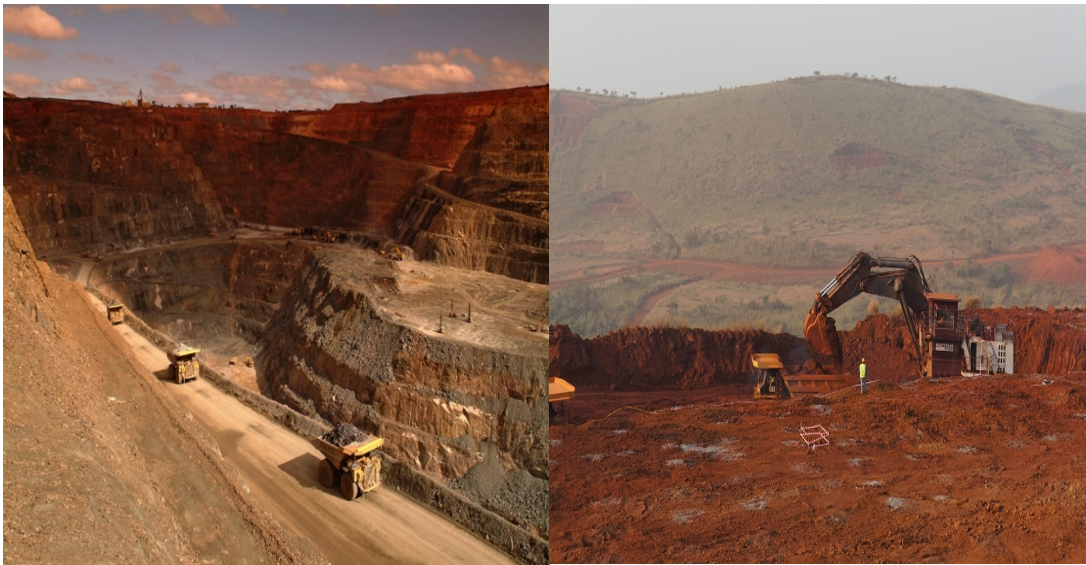
Figures 4. Iron ore mining and clearing [55, 56].

Koidu Holdings employs approximately 600 workers with an average monthly salary of $250, while the lowest being $130, and the company is believed to be spending around $300,000 a month on salary. According to the Koidu Holdings [59] report, the company further spends around $100,000 to support the two major football teams and awarding scholarships to senior students in the district. These companies employ many local residents who are physically fit for labor jobs, while at the same time, employ citizens with skills from various parts of the country. Similar sponsorship programs and employments are undertaken by the Sierra Rutile and Shandong Iron ore mining companies.