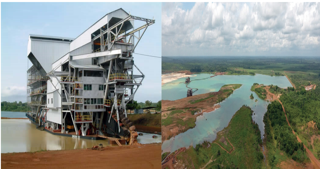
Figures 3. Sierra Rutile Dredge and artificial lakes and ponds [53, 54].