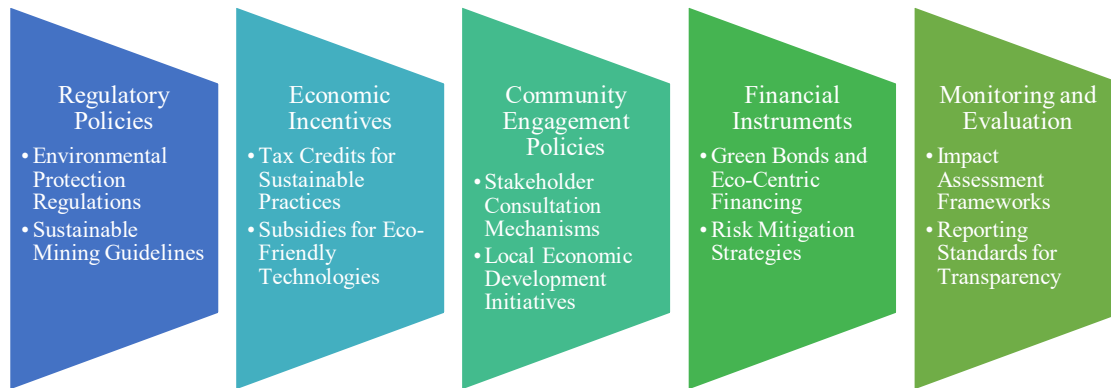
Figure 2. Framework for Promoting Eco-Centric Financing in Mining Cities.