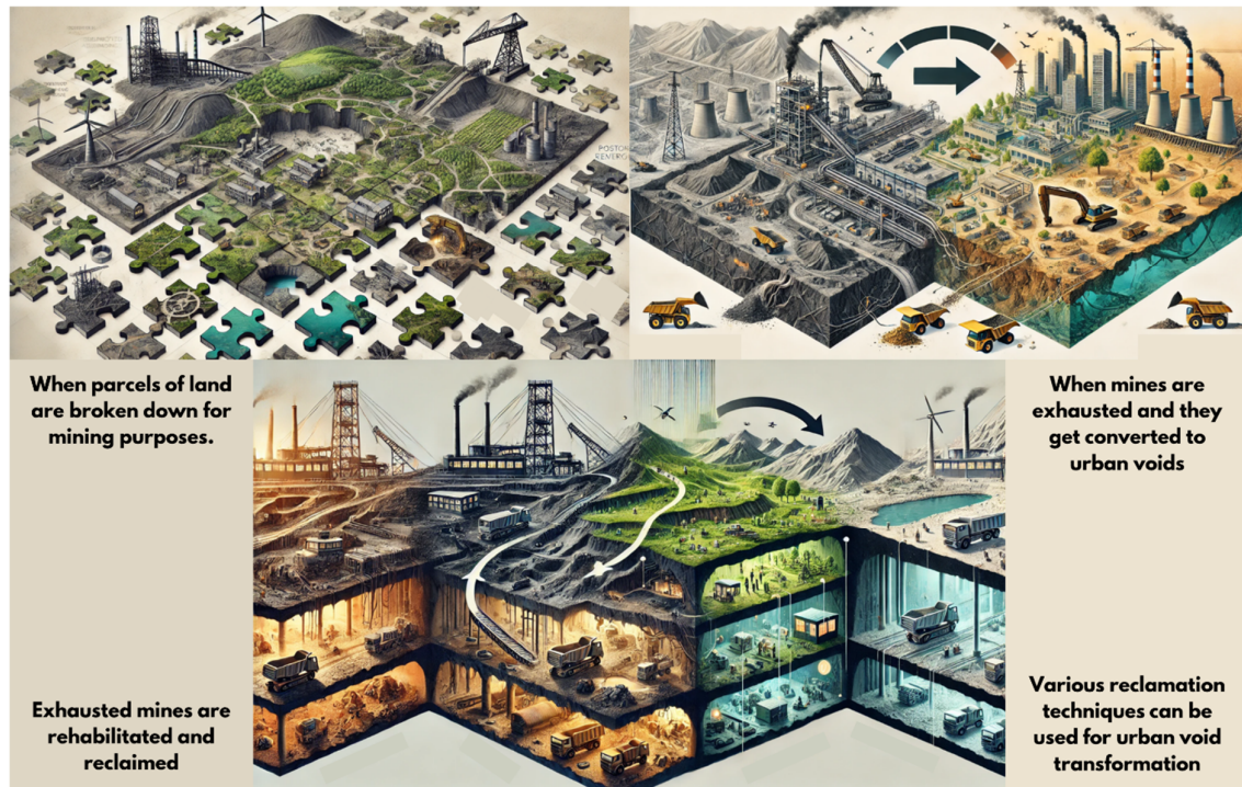
Figure 1. Transformation of mined land into urban voids and their reclamation through various techniques for sustainable redevelopment (Source: Authors).