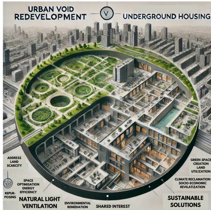
Figure 2. Urban void redevelopment through underground housing as a sustainable solution for land utilization and socio-economic revitalization.

comprehensive frameworks and metrics that can guide planners and policy-makers in leveraging the synergies between these approaches. Future studies can then help develop a more comprehensive understanding of how to turn mining areas into habitable and resilient urban areas.